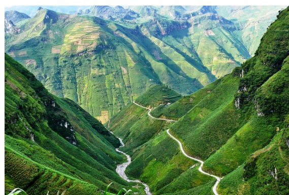
The mountains near Ha Giang

Days 34 - 35 We will definitely be off the beaten track in the remote mountains near the Chinese border for two days of scenic driving. The first night will be spent in Ha Giang and the second in Cao Bang .