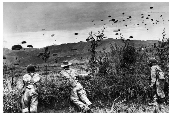
A reminder of the war

Day 31 A mountain ascent takes us to the border with Vietnam – now in the north near the border with China. This is Vietnam war area and where opium poppies are grown. We shall stay in Dien Bien Phu – the site of a 57 day siege which is considered to have ended French domination of the area. It is situated at the northern end of a pancake flat heart shaped valley with the Nam Rong River running through it. There are battleground sights for those who are interested.